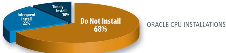
Taking a Big Risk: The Sentrigo DBMS Patching Survey

Sentrigo published a survey of over 300 Oracle professionals, revealing that two-thirds of users polled had never applied quarterly patches. Respondents reported that the patching process was time-consuming, and regularly required DBMS downtime and the regression testing of appliances.